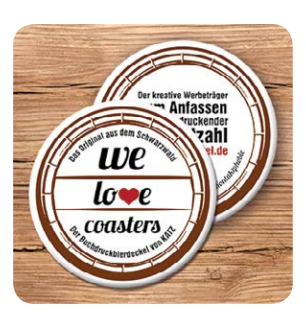
Letterpress beer mats