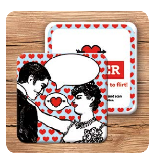
Augmented reality beer mats